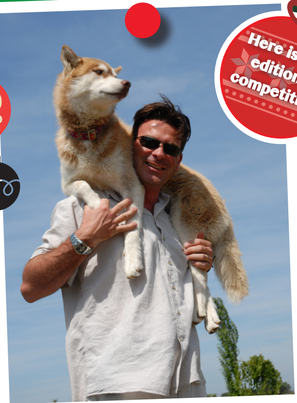
Last edition's picture...

"What do you mean walkies? I am on holiday too!"